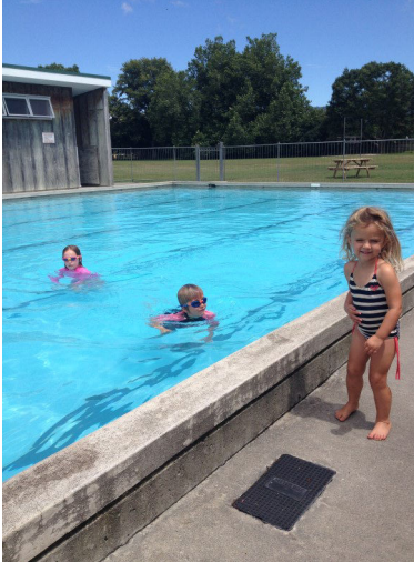
Kids enjoying the Pirongia School Pool