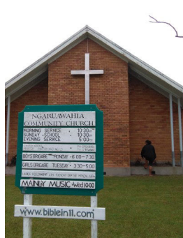
Front view of church

The camp is a huge facility and can accommodate 2 camps at once. We never even knew it was there! Such a great spot right on the Waikato river and with loads of cool stuff to do. The maintenance man, Rob, was so grateful to have the team there to help that he even put a big BBQ lunch on for all the MMM team—about 18 of us—on the last day. So great to be able to go and encourage him.