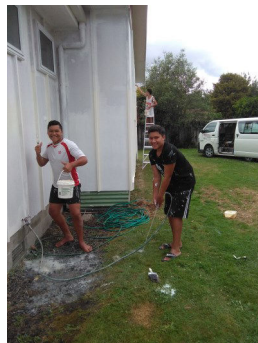
A little help from the locals