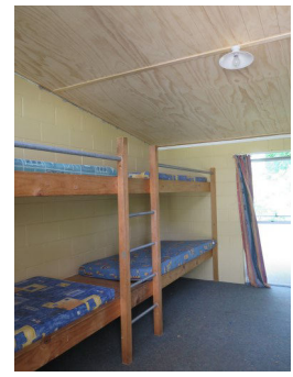
Lovely new ceilings!