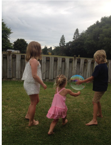
Bubble fun at home