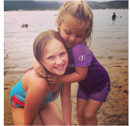
Last weekend in Pauanui